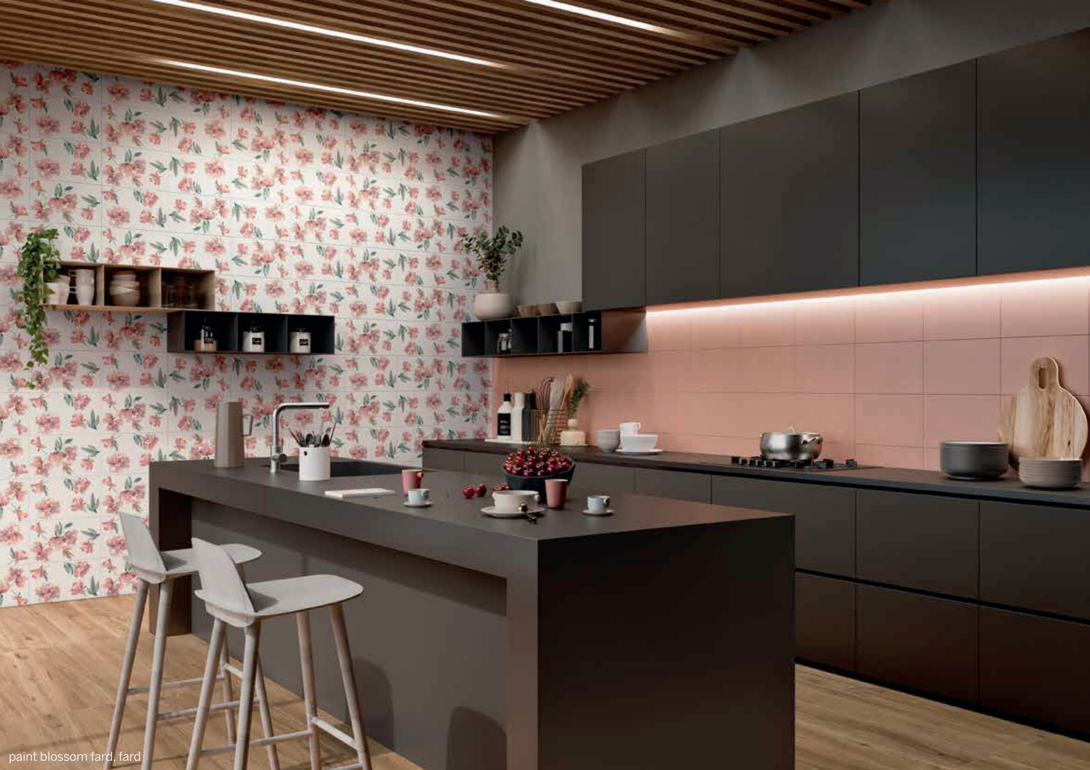
paint blossom fard, fard