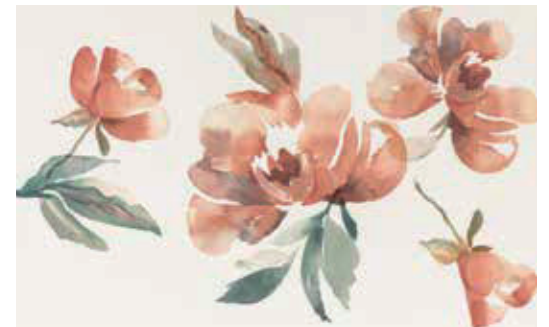
25x40 cm paint blossom fard