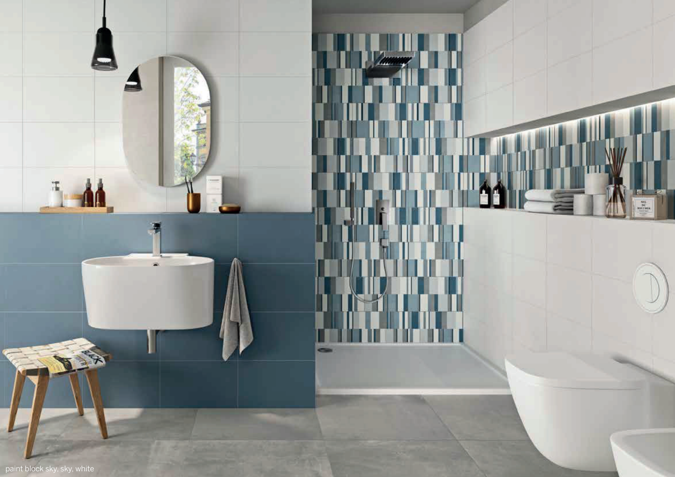
paint block sky, sky, white