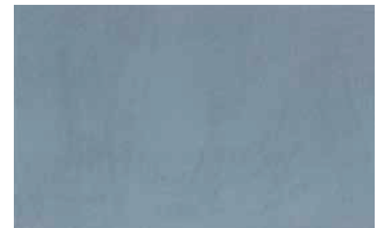
25x40 cm paint sky