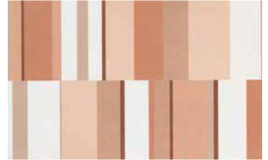
25x40 cm paint block fard