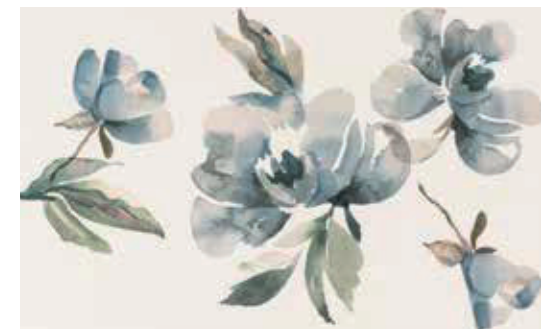
25x40 cm paint blossom sky