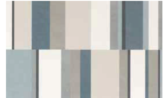
25x40 cm paint block sky